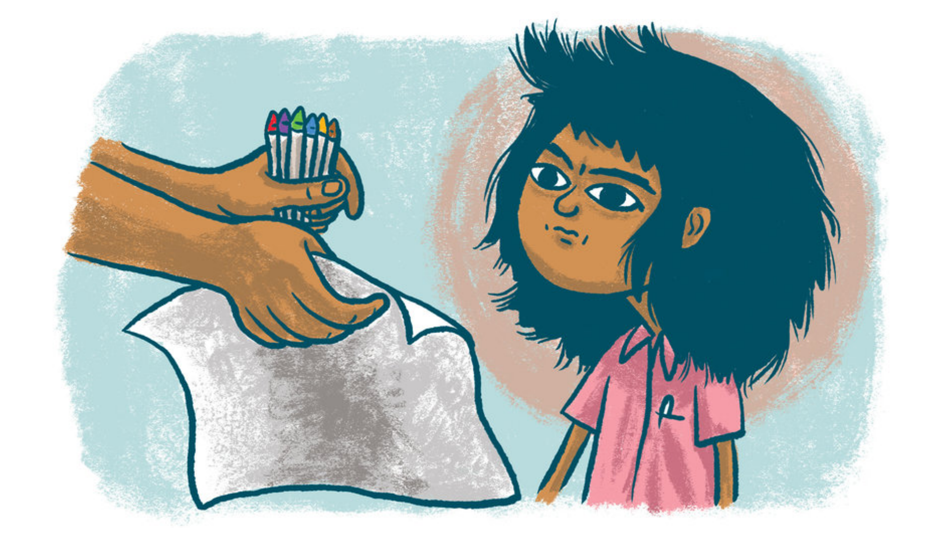
"Would you like to draw it?" asked Appa. "Here's a nice sheet of paper and some crayons."