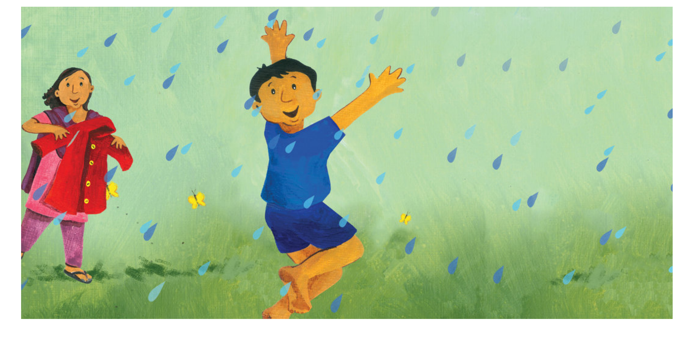
"But Manu," called Ma, running after him, "you forgot your raincoat!"