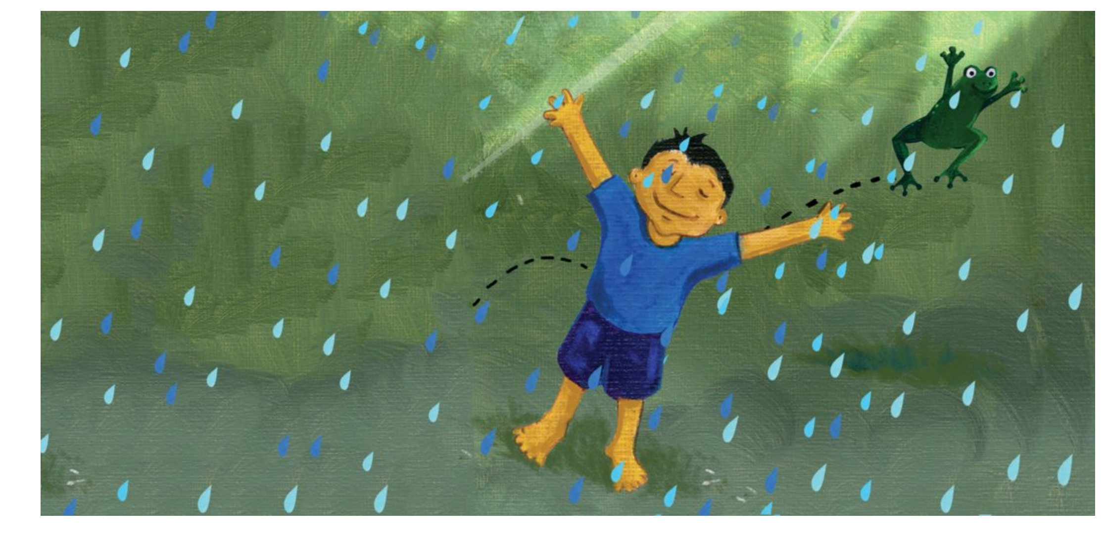
And then at last, it started raining! "Oh, it's raining, it's raining," sang Manu, running out.